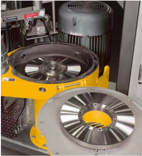
Mill Chamber with Disposable Discs