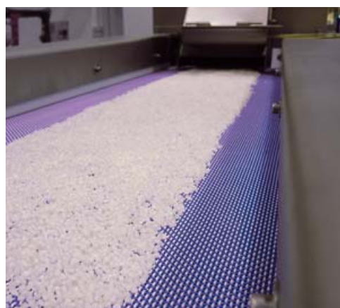
Conveyor belt with pellets