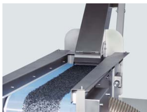
DURO belt dryer

The pellets may be further cooled in subsequent components, e.g. a spiral cooling conveyor. The collected water 04 is recirculated back to the process loop.