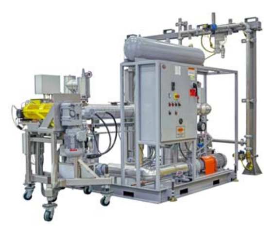
MAAG Gala Pelletizer / Melt Line

MAAG Gala has a fully equipped lab for testing and pelletizing adhesives to your specifications. Adhesives range from easy to pelletize and package. High viscosity to the pressure sensitive, low viscosity adhesives that require specialized processing. We can pelletize most adhesives and accommodate special batch runs to assist you in speeding your products to the market. Our customers are always welcome to visit our facilities to witness and assist in the pelletizing of their own adhesives at our technical center.