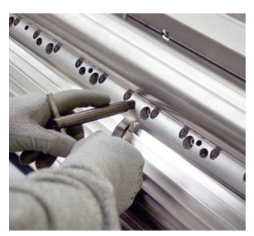
Cutting gap setting