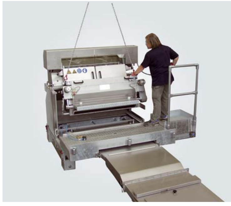
Cutting head quick-change