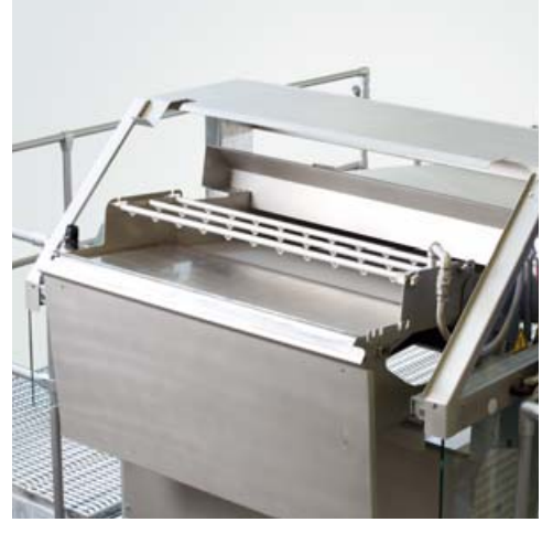
M-USG 1200 H start-up device