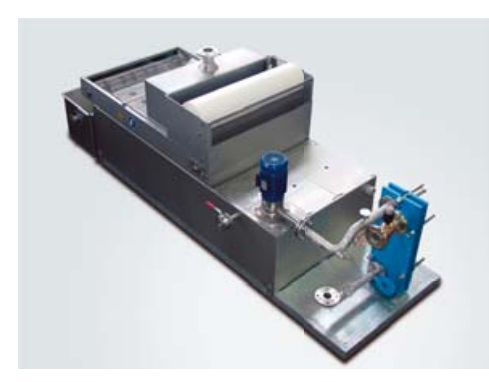
Process water treatment system PWS-BF