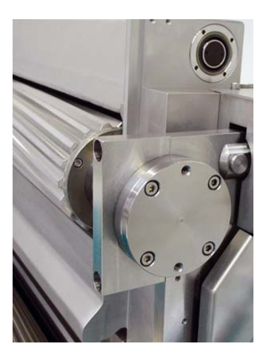
Roller bearing support outside of cutting chamber