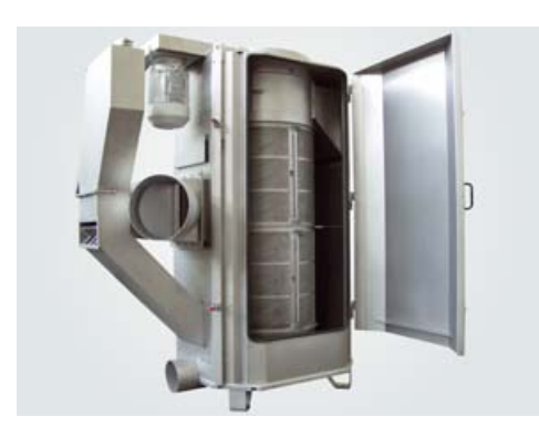
CENTRO centrifugal dryer

Underwater pelletizing strand systems - Only the quality of the system configuration counts