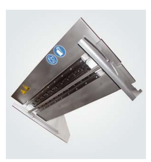
Die head with die wiper

Optimum component selection ensures high guarantees of availability, making the pelletizing process more cost-effective. Due to system layout operators have easy access for operation and maintenance.