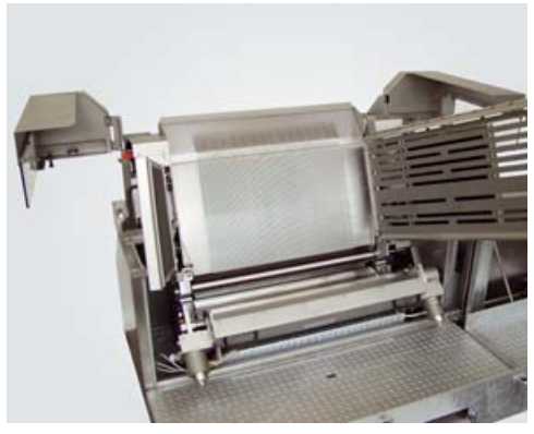
M-USG 1200 V strand guide