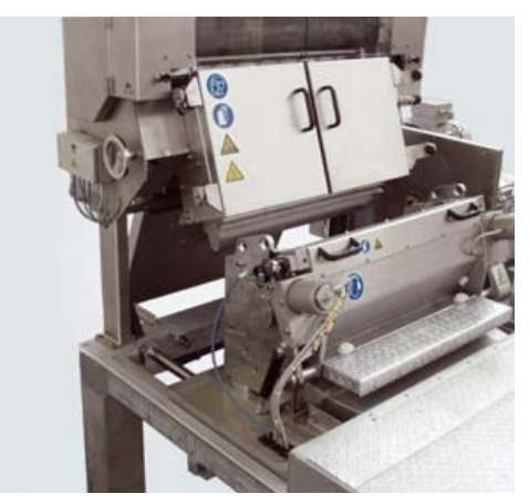
M-USG 900 V