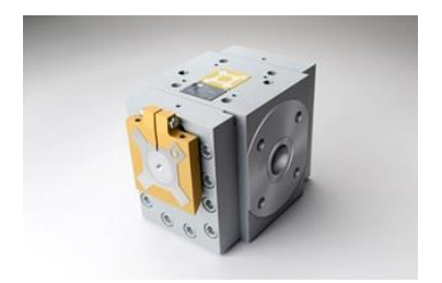
Photo: Maag's extrex<sup>6</sup> gear pump for plastic- and elastomer processing