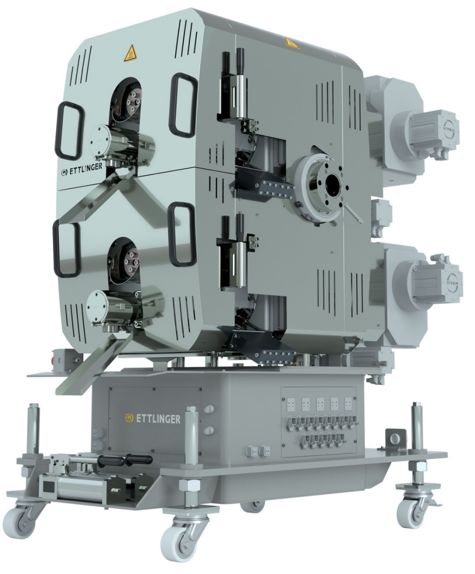
Ettlinger's new ECO 500 high performance melt filter achieves throughputs of up to 4,000 kg/h

Königsbrunn/Germany, May 2021 - ETTLINGER, a member of the MAAG Group and a leading manufacturer of continuously operating high performance melt filters, has unveiled a new generation of tried-and-tested ECO products for use in PET recycling. Their new features take into account the need for systems with a higher product throughput and are initially available in sizes suitable for medium-sized recycling lines. The new performance enhanced ECO 350 replaces the former ECO 250, while the new ECO 500, capable of achieving capacities of up to 4,000 kg/h, replaces the former ECO 250 Twin. The ECO 200 completes this range.