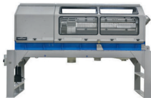
Gala Tumbler Model T/C—203