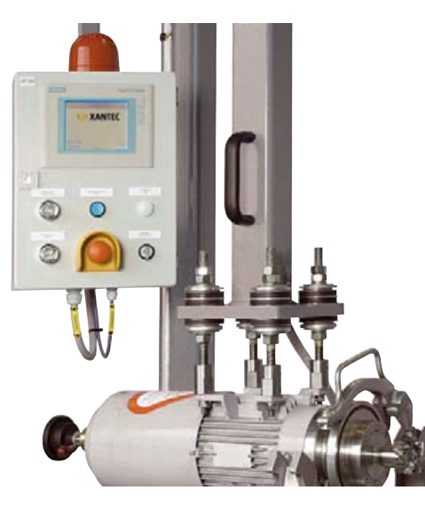
Operator panel with touch screen and Model MAP-5 Pelletizer

All necessary electrical controls, based on state-of-the-art touch screen technology, are contained in a modular panel standing on the frame of the system.