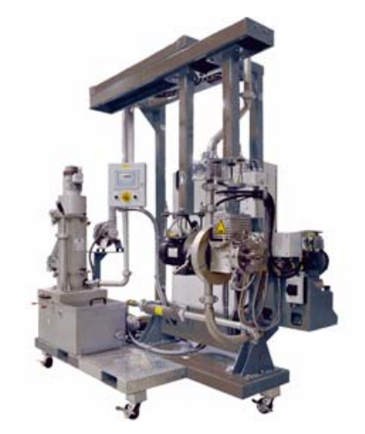
LPU<sup>™</sup> with operator panel and SLC pelletizer