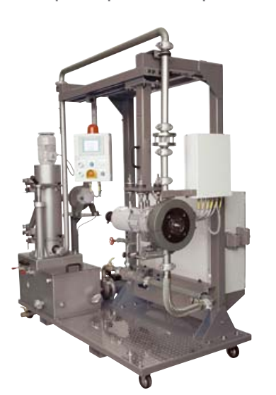
LPU<sup>™</sup> melt connection to die plate