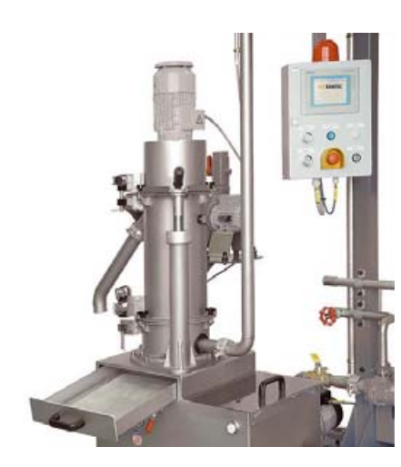
Fines removal built into water tank