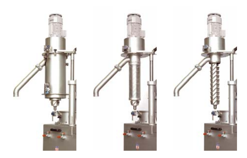
Left to Right: Model 1150 Dryer housing, screen assembly and rotor