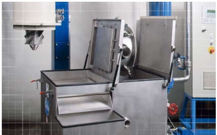
Fines Removal Screen Access

The dryer base section is bolted to one of the two tank lids for quick, easy cleaning and service by simply raising the lid.